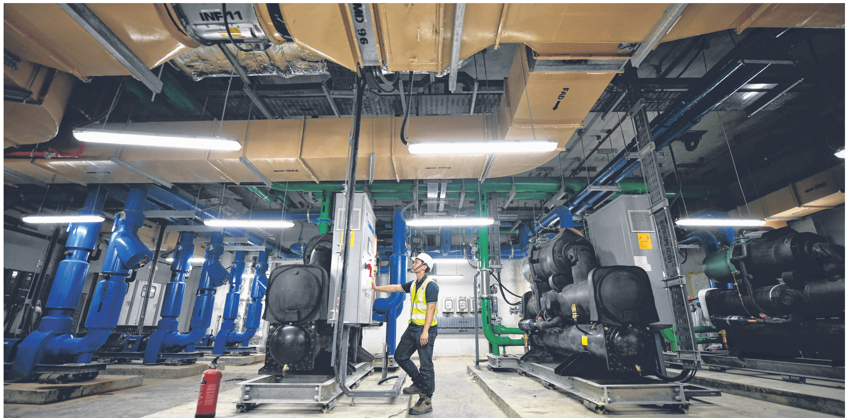
A Land Transport Authority engineer checking the environmental control system that controls the air-conditioning in the Tampines West station and tunnel ventilation. MRT operators SMRT and SBS Transit are still recruiting staff, especially engineers, said Transport Minister Khaw Boon Wan.